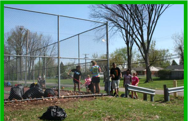
A community group helps rake leaves at Community Park